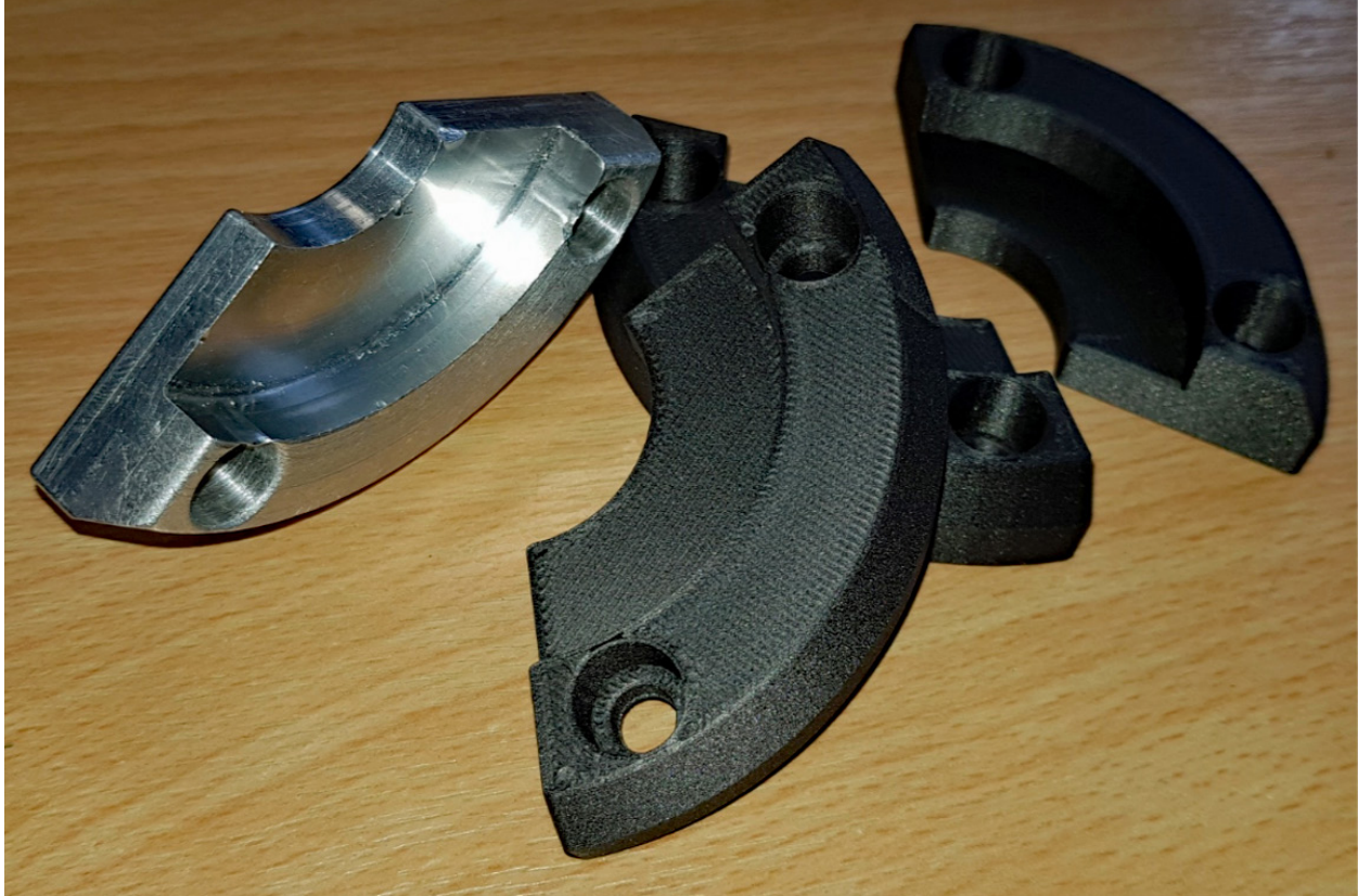
A 3D printed jaw accessory produced in FDM Nylon 12CF – these parts save up to 80% of machine setup time.